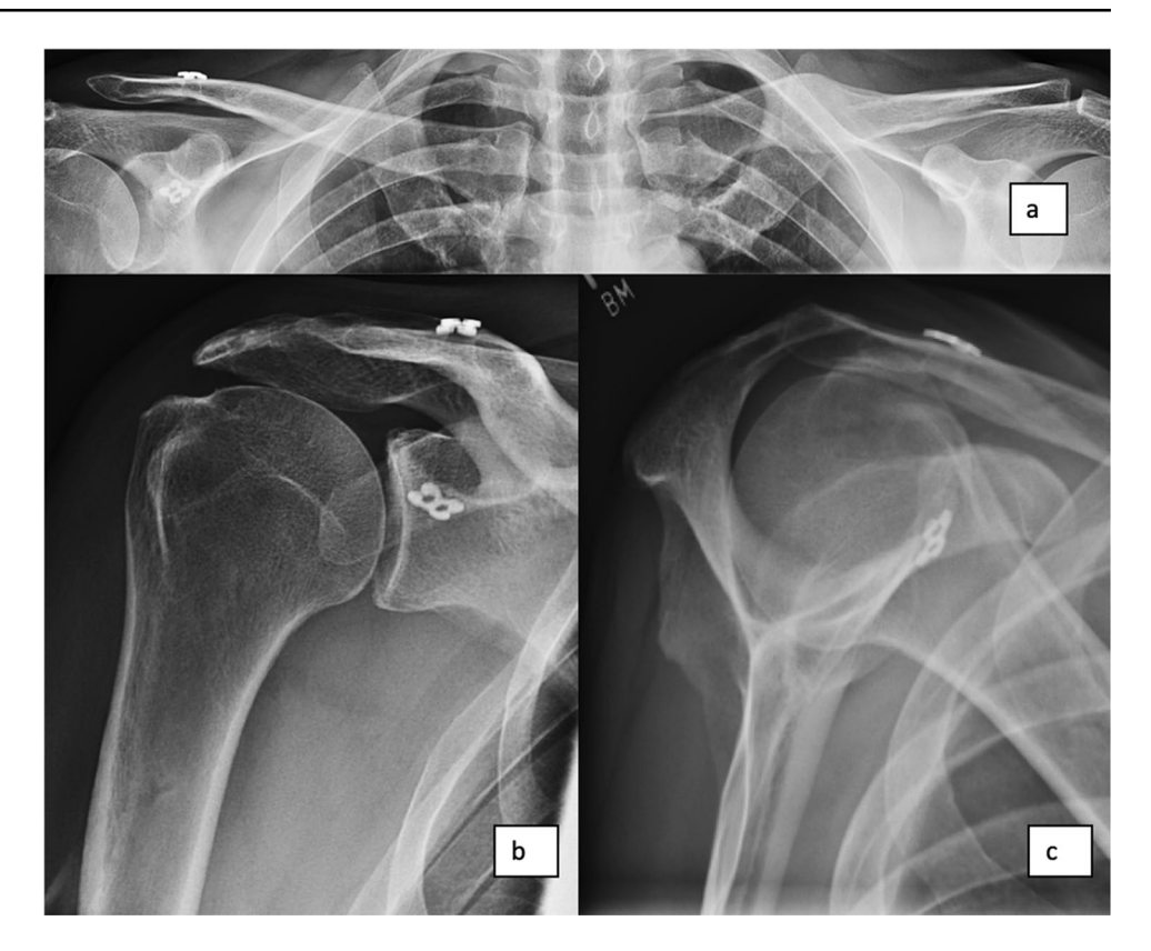
Fig. 3 Follow-up X-ray after acromioclavicular (AC) reconstruction with ipsilateral gracilis graft and coracoclavicular (CC) reconstruction with Fibertapes and 2×Dogbones (Arthrex Inc., Naples, FL, USA); a panorama view, b a.p. view and c Alexander view

allowed while return-to-work and return-to-sports were expected 12 weeks postoperatively.