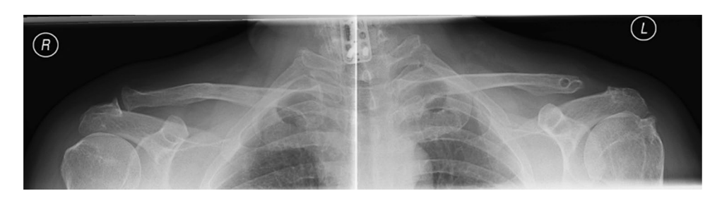
Fig. 1 Acromioclavicular reconstruction (left side) of an iatrogenic, horizontal instability of the acromioclavicular joint with the ipsilateral gracilis tendon graft

shuttled in a box technique while the tendon was shuttled in a figure-of-eight technique by using the shuttle sutures (Arthrex Inc., Naples, FL, USA). The fiber tapes (Arthrex Inc., Naples, FL, USA) and the graft were then knotted and the loose ends of the graft were used as an interposition inbetween the ACJ. Care was taken to meticulously close the deltotrapezial fascia.