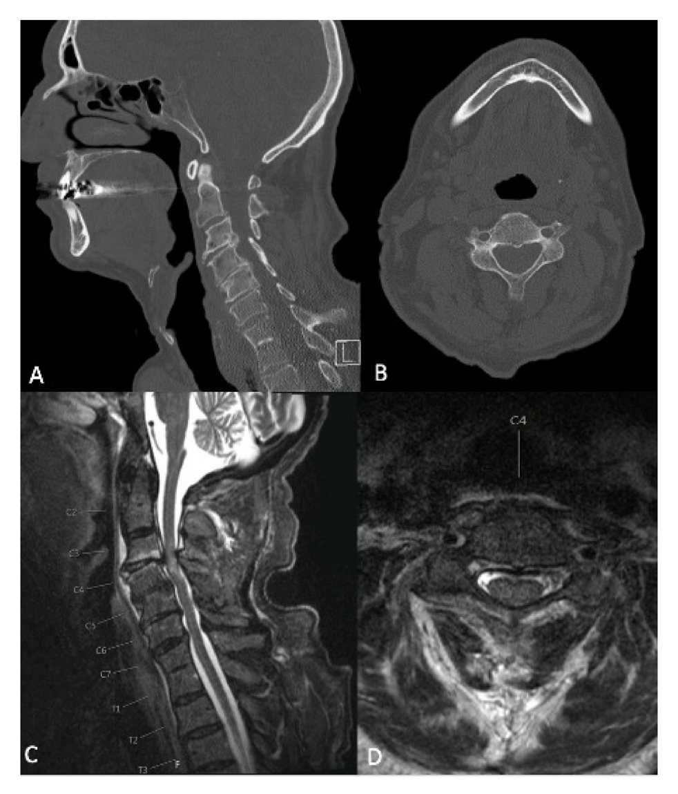
Fig. 2. Example for necessity of MRI in traumatic spinal cord injury: 74-year-old male patient with ventrolisthesis C3/4 on CT scan (A,B) but without notion of hematoma or fractures. A contusion on C3/4 could be detected as well as a DLI in MR imaging (C,D).

M. Barz et al. Brain and Spine 2 (2022) 100882