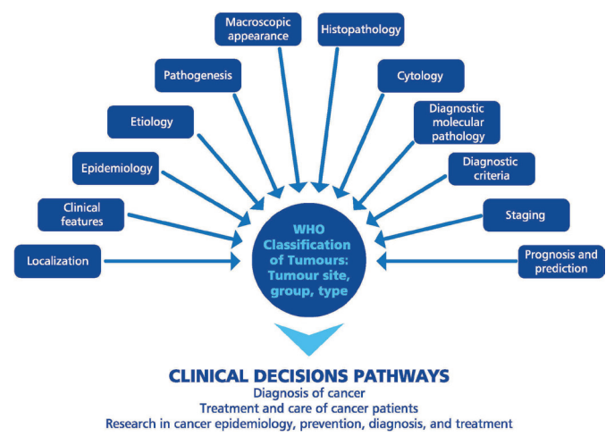
Figure 2 Framework for the evidence gap map of cited evidence in the WHO Classification of Tumours of the Lung.

EGMs of the WCT are not only important to support the continuous improvement of the accuracy of the classification, but will potentially have wide-reaching impact on pathological diagnosis over time, by promoting evidence-based approaches and endorsing standardisation of reporting in international research. These EGM's will also serve as the basis for focused efforts in research, guiding future projects and maximising its impact. The ultimate beneficiary will be the patient who is the centre of all cancer diagnoses and treatment.