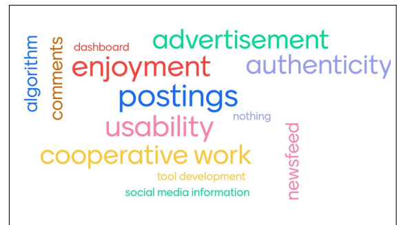
Figure 3: Students’ experiences with INSTACLONE

The major learning goal of INSTACLONE is to foster students’ data literacy through a lifelike social media experience. In this respect, we first asked the students a general question - e.g., whether they became more interested in social media after using INSTACLONE - and then asked whether they were now more interested in the data used by social media tools. Most of the students responded that the lesson did not increase their interest in social media, likely because it is already a common theme. Nevertheless, INSTACLONE seemed to demonstrate that the students became more interested in data that are used in a social media context. Twenty students rather agreed on the question of whether INSTACLONE increased their interest in data, and three students fully agreed. On the other hand, only eight students fully disagreed on this question, and 12 students rather