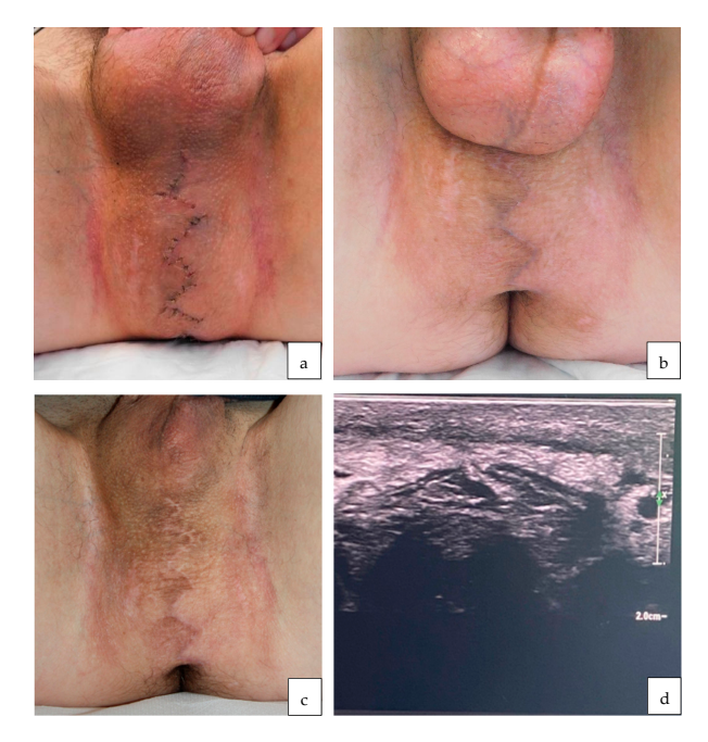
Figure 5. Clinical presentation of the surgical site at various follow-up visits: ( a ) Two weeks postsurgery showing regular wound healing, ( b ) six weeks post-surgery and ( c ) six months post-surgery showing minimal scar tissue formation (Vancouver scar scale) and no signs of a residual mass tissue. ( d ) The ultrasound at six months showed no sign of recurrence.

The patient was seen in our outpatient clinic electively one day after dismissal, and then two weeks, six weeks, six months and twelve months post-operatively. The wound healed uneventfully. At six weeks post-surgery, the patient reported reuptake of cycling without discomfort and still no issues with pain, sensibility impairment, erectile dysfunction or dysuria. Figure 5 shows the patient's perineum and scrotum at the two week, six week and six month follow-up with regular wound healing, minimal scar tissue formation (Vancouver scar scale 0) and no signs of a residual mass tissue. Ultrasound examination six months post-surgery showed neither fluid collection in the sense of oedema nor signs of recurrence (Figure 5).