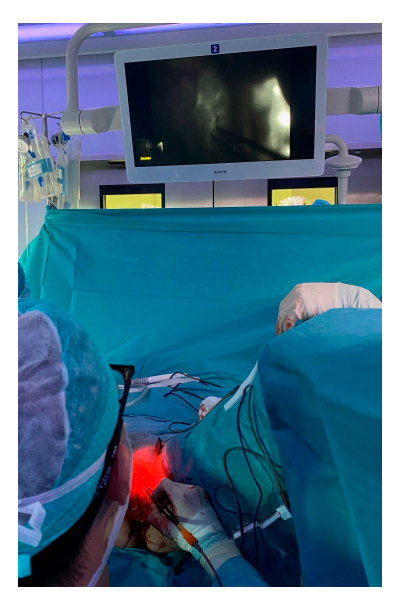
Figure 4. ICG imaging: 5 mL indocyanine green solution (VERDYE 5 mg/mL, Diagnostic Green GmbH, Germany) were injected subcutaneously bilaterally into the proximal inner thigh. An ICG handheld camera (IC-Flow<sup>™</sup> Imaging System, Diagnostic Green GmbH, Germany) was used to detect lymphatic flow and possible leakages, which were subsequently obliterated using bipolar cautery forceps.

Figure 3. Step-by-step operative technique: ( a , b ) The patient was placed in a lithotomy position. The incision was marked, planning for a multiple W-plasty reaching from the apex, near the scrotum, down to 1 cm above the anus. ( c ) After deepithelialization of a 3 cm wide dermal strip to the left of the planned incision, the tumor was dissected en bloc with overlying tissue under conservation of blood vessels, nerves and surrounding muscle. ( d ) After hemostasis and obliteration of lymphatic leakages, a Redon drain (10 Charrière) was inserted before placing the deepithelialized strip underneath the opposing edge of the wound and fixing it transcutaneously to provide a padding-effect by doubling the tissue. The overlying W-plasty was adapted, and the skin was closed via simple interrupted suture. ( e ) A negative pressure wound therapy device was placed epicutaneously over the surgical wound, applying a continuous negative pressure of 125 mmHG.