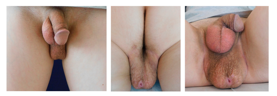
Figure 1. Clinical findings upon the first visit at our department of plastic surgery: The patient presented with a 12 \times 6 \times 4.5 cm large, mobile, non-tender, partially fibrotic mound of excess perineal tissue extending from the posterior base of the scrotum to the perianal area. On the base of the tumor, a small, circular, secreting ulceration could be seen that had only developed in the recent months.