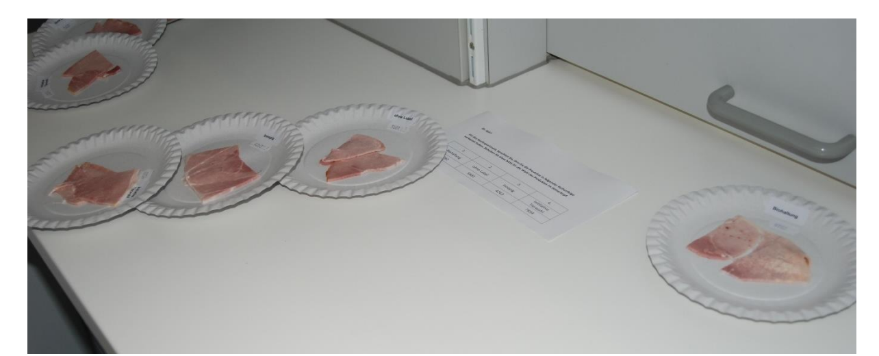
Figure 2. Tasting of the products in Data Collection 1.

Thereby, a nine-point hedonic liking sale as the standard measurement in sensory studies was included in the survey. Participants rated the four products regarding appearance, aroma, texture, taste, and overall liking. For evaluations in the first and third round, participants received two 1/8<sup>th</sup> slices of cooked ham, see Figure 2. The plates were labeled with a four-digit identification number, plus in the third round, the product's name. The order of the samples varied randomly across participants. Furthermore, participants received a paper that reminded them of the order of tasted products and water and unsalted crackers to cleanse palates and minimize carryover.