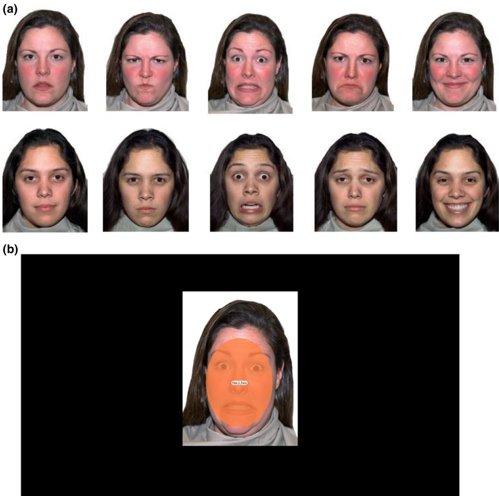
Figure 1. Presented stimuli from the NimStim set of facial expressions (Tottenham et al., 2009) (a) and an example of the AOI 'face' displayed for the fearful emotion (b). [Colour figure can be viewed at wileyonlinelibrary.com ]

For each female face, the five facial expression pictures were shown one by one in the same order (due to the correlational approach): neutral, angry, fearful, sad, and happy. To prevent that the novelty of the faces and the displayed emotional information are confounded, the neutral facial expression was always presented first for each face. Each picture was presented for 10 s and followed by 2 s of a black screen to exclude transmission effects from one trial to the next. Before the presentation of the first picture and before the presentation of the second face, a short attention-getter was presented on the centre of the screen. After completion of the task, a short movie was played as a reward.