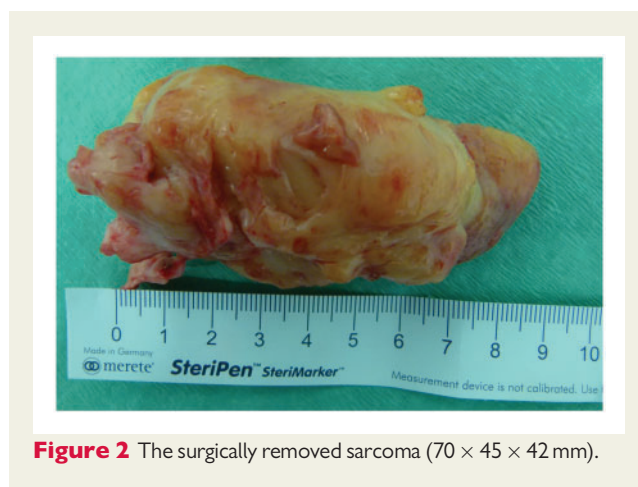
Figure 2 The surgically removed sarcoma (70 × 45 × 42 mm).

Palbociclib is a CDK-4 inhibitor that is currently licenced for hormone receptor positive, human epidermal growth receptor 2 negative breast cancer. There is also phase II trial evidence for its use in liposarcomas which exhibit abnormal amplification of CDK-4(6). Its efficacy of CDK-4 inhibition is inversely related to levels of p16ink4 mRNA levels on immunohistochemical analysis. 7 Palbociclib is an oral agent administered over a 28 day cycle; 125 mg daily for 21 days followed by 7 days off. 6 The number of