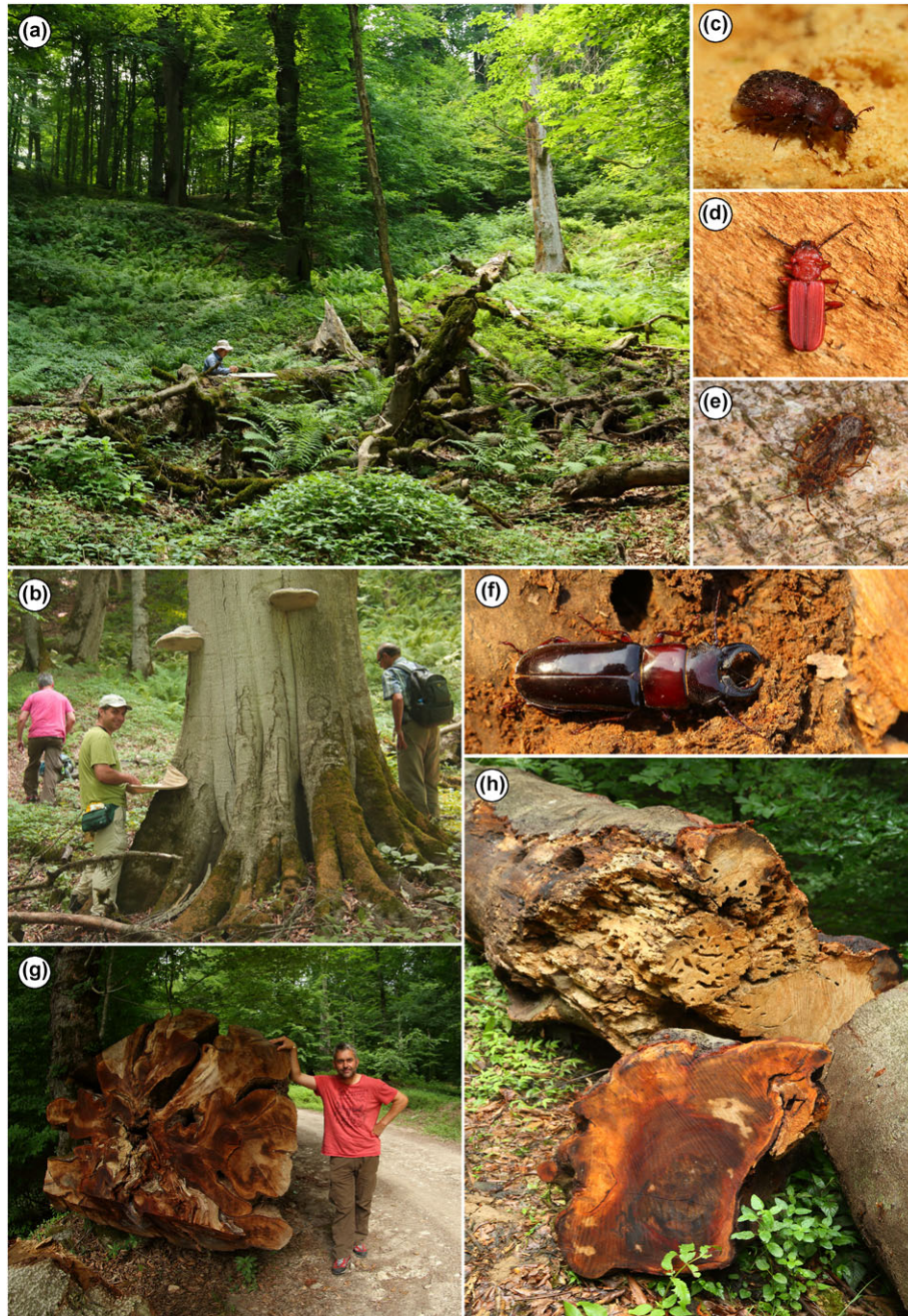
Figure 1 In Hyrcanian beech forests (a) die back of old trees produces a high diversity of dead wood features and light regimes and (b) large old trees are widely distributed. The forests are characterized by high biodiversity including many endemic species, such as (e) the flat bug Aradus elburzanus and (f) the longhorn beetle Parandra caspia , as well as dead wood specialists of European conservation concern (d) Cucujus haematodes caucasicum and (c) the stag beetle Aesalus ulanowski . The new law allows use only of damaged trees (g) with high ecological importance but (h) low economic value.

true bugs for 45 minutes (= 225 sampling minutes/plot) using a broad range of standardised methods covering the different habitats of these species (Gossner et al. 2013). Based on our experience in European beech