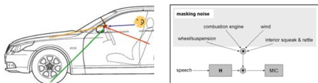
Figure 1: Speech and masking sound (left) and information flow (right).

Choice of Vehicles and Road Surfaces. Interior noise masking varies depending on vehicle class and derivatives. In order to cover a wide spectrum of car versions speech should be superposed by the interior noise of four very different vehicles as seen in tab. 1. In this