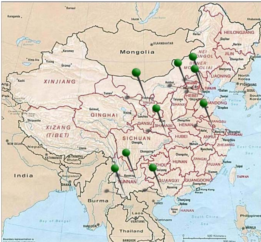
Figure 2 Geographical map of the Sino-German co-operative projects.