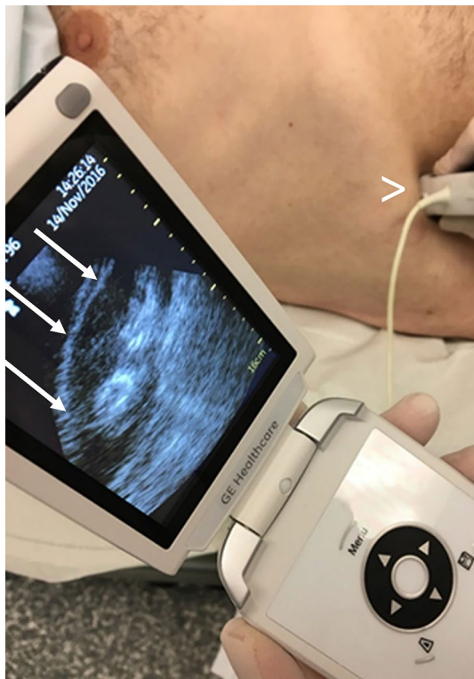
Fig. 1 Examination with the HHUD GE Vscan v1.2: the probe (>) is positioned in the upper abdomen of the patient. On the monitor of the HHUD you can see the right kidney (→)

All examinations were performed with the GE Vscan v1.2 (GE Medical Systems, Milwaukee, WI, USA; broad bandwidth phased array transducer: 1.7–3.8 MHz; Fig. 1). Stationed in our uro-nephrological ultrasound department, the HHUD could be used whenever needed for sonographic evaluation of patients on our nephrology/ rheumatology ward, for patients while on dialysis, in the nephrological outpatient clinic or for any other nephrological consultation in the hospital. The investigators were all ultrasound-experienced physicians in our nephrology department, who had