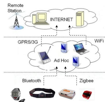
Fig. 1 Three layer hierarchical network architecture of wireless body sensor network

However WSN was not specially designed for monitoring human body as the human body is a smaller scale environment which requires appreciation of a slightly different set of challenges. The unsuitable WSN design for monitoring human body and its internal environment has directly triggered the development of wireless body sensor network (WBSN) with locally computational intelligence, which could provide pervasive monitoring environment while at the same time guaranteeing the mobility of monitored patients [8] . WBSN comprises a series of miniaturized wearable or implantable sensors which accurately capture physiological data from patients and transmit all the data, either raw or low-level processed, wirelessly to a local mini-processor unit (or known as a base station) for further processing. After all required data are collected in this way they would be transmitted to a remote central server via wireless LAN, Bluetooth or GPRS/GSM networks [9] .