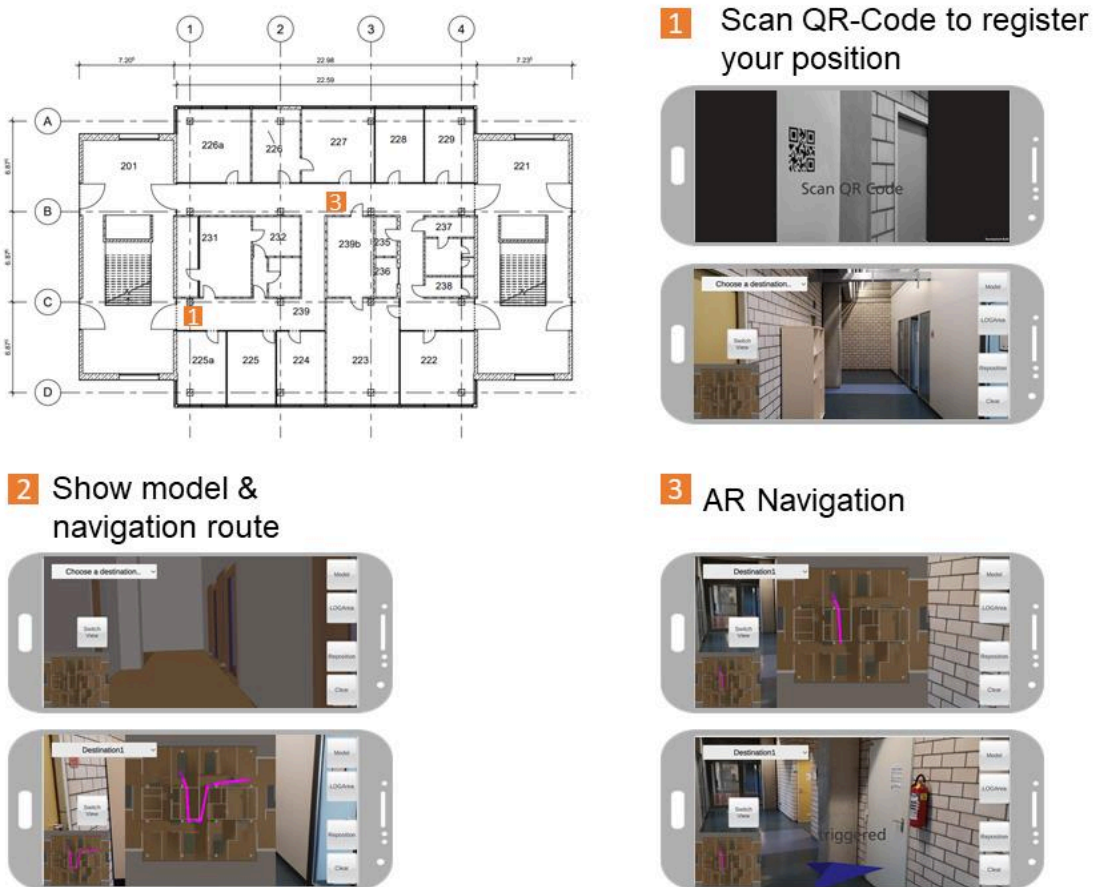
Figure 2: Exemplary Usage of the Logistics App

In the following, two application scenarios are outlined for the usage of the logistics app: