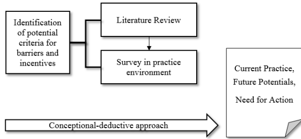
Fig. 1. Research approach