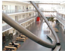
Branch Library Mathematics & Informatics