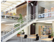
Branch Library Chemistry