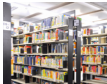
Branch Library Sport & Health Sciences