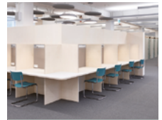
Branch Library Medicine