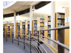
Branch Library Weihenstephan