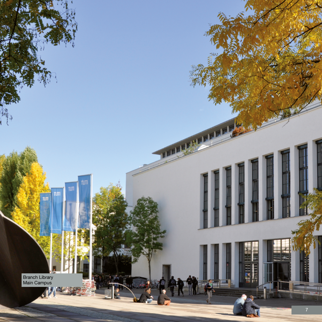
Branch Library Main Campus