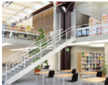
Branch Library Chemistry