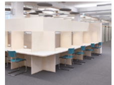
Branch Library Medicine