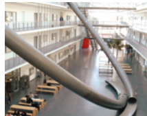
Branch Library Mathematics & Informatics