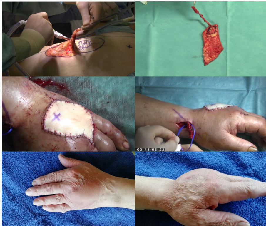
FIGURE 4 Crush injury of the mid-hand featuring comminuted fractures accompanied by extended soft tissue loss in an obese patient. A reverse posterior interosseous (PIA) flap would have been a reconstructive option, however a free flap tailored to the defect was chosen (Video 2). Upper left: Figure 4 showed a suprafascial anterolateral thigh (ALT)-flap harvest using the hot-/ cold-zone dissection concept. Upper right: Although the patient (flap no. 12) was obese (BMI 37 kg/m 2 ) a thin flap could be raised. The dissection of the hot zone (blue marking) was slowed down to microsurgical preparation. Middle left/right: After inset the flap did not show excessive bulk. No secondary flap thinning procedures were necessary. An initial color mismatch resulted from a heavy teint in the upper body. The discrepancy resolved as expected some weeks later (see Video 2). Lower left and right: Situation 22 months post-operatively. Though the patient was offered a thinning procedure he was content with the functional outcome and refused any further surgeries