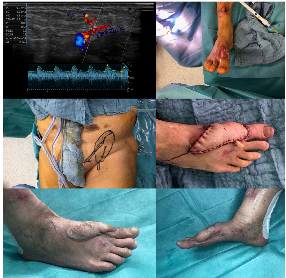
FIGURE 3 A color-coded duplex sonography (CCDS) measurement of blood flow velocities in a medial branch perforator of a free superficial circumflex iliac artery (SCIP) flap. The free tissue transfer was used to reconstruct a forefoot defect. Upper left: Quantitative values of hemodynamics were measured. In this medial branch SCIP-perforator first, an arterial signal was confirmed. It showed a peak systolic velocity of 9.9 cm/s (flap no. 23). Upper right: Small size full thickness defect of right forefoot (flap no. 21). Middle left: Preoperative skin marking of SCIP flap design. The EP and axis of the medial perforator were marked (vertical line just above inguinal crease). The flap design was completed before incision. Middle right: SCIP flap after inset showed adequate perfusion after transplantation to the dorsalis pedis vessels. Lower left and right: Flap healed 10 months post-op showing only moderate bulkiness

perforator PSV was 16.99 \pm 6.07 cm/s, mean EDV was 5.01 \pm 1.84 cm/s. A RI in perforator vessels of 0.7 \pm 0.08 was calculated.