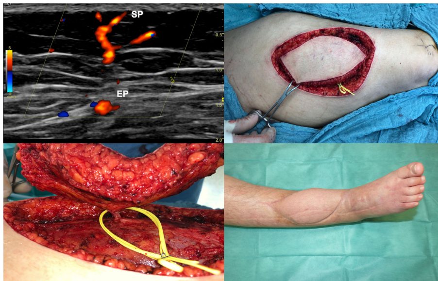
FIGURE 2 An example of color-flow perforator imaging in an anterolateral thigh (ALT)-flap procedure with intraoperative confirmation of a perforator at mid-thigh level (flap no. 13). Upper left: Color-flow ultrasound (US) enabled live visualization of microvessels in high imaging quality. In this ALT-flap design, preoperatively the superficial low flow perforator vessel could be imaged using color-coded duplex sonography (CCDS) from its emergence point (EP) at the deep fascia level up to the subdermal plexus. Its vascular course (higher flow in source vessels) through deeper muscle tissues was visualized simultaneously. Upper right: The EP has been marked on the skin and the flap design completed. The entire flap may then be circumcised. Lower left: The intrasurgically located target perforator corresponded exactly to its preoperative skin marking. Lower right: Flap 12 months after transfer