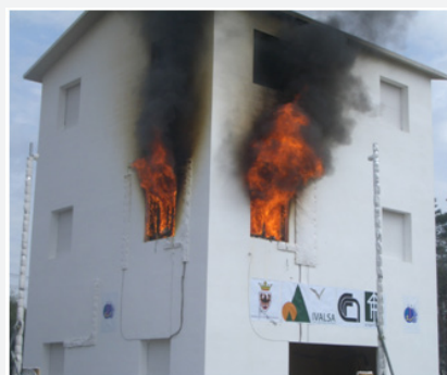
Figure 2: So called natural full-scale fire tests performed in Japan 2006 [27].

Fire accidents do not follow a plan and are difficult to predict. Reasonable measures should be taken to limit the consequences. Due to the nature of fires their development may vary significantly independent on the structural material. Thus, fire resistance tests following standard fire exposure are a commonly accepted measure of comparison as they provide a defined fire exposure for the tested product - independent of the material - similar to a post flash over fire [9,26]. The repeatability of compartment tests is low as the test boundary conditions cannot be controlled entirely. However, numerous compartment tests have been performed also with CLT with various purposes. Introducing CLT on the market, experiments have been performed in coordination with fire services to assess the capability to extinguish these compartments with common