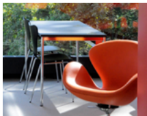
Branch Library Physics