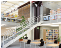
Branch Library Chemistry