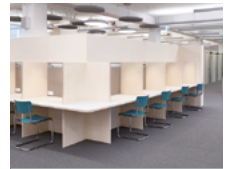
Branch Library Medicine