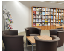
Branch Library Straubing