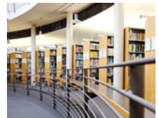
Branch Library Weihenstephan