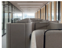
Branch Library Sport & Health Sciences