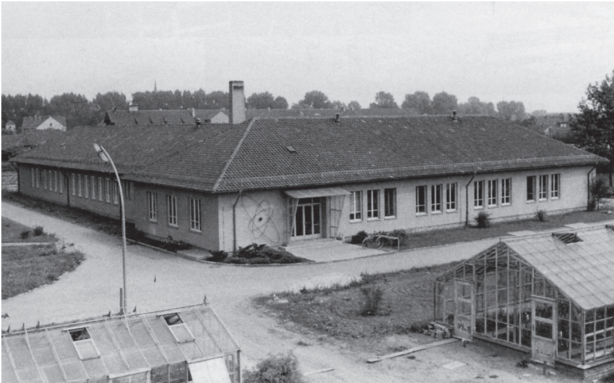
Figure 1: Isotope laboratory of the institute for research on cultivated plants of the East German Academy of Agricultural Science, Gatersleben. Please note the stylized atom at the left side of the entrance.

and even, in the area of food irradiation, to technical facilities in the USA, which demonstrates that they were well informed about the latest research in the West (figure 1).