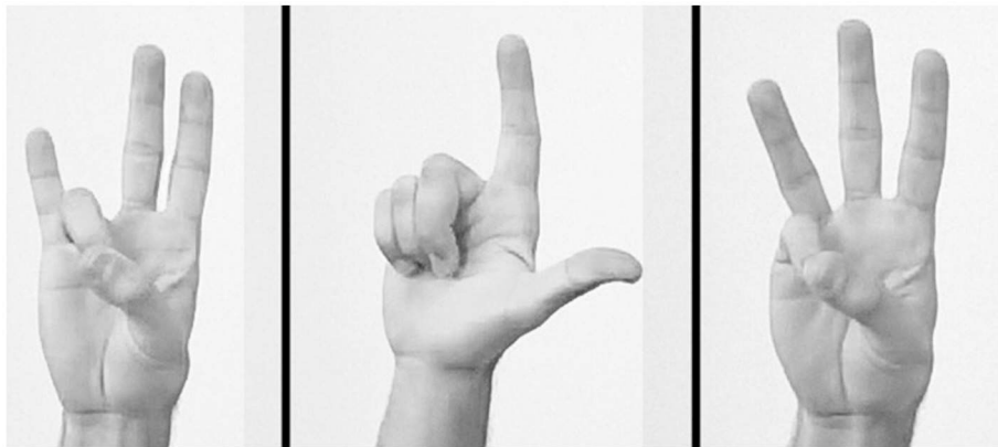
FIGURE 2 | Imitation of meaningless finger gestures. Three examples of the 10 assessed gestures.