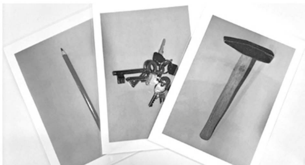
FIGURE 3 | Pantomime of object use. Three of the 20 shown pictures.