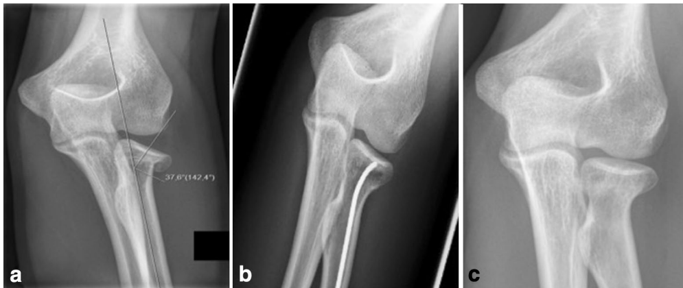
Fig. 2 a.p. X-rays of patient nr 7 (see Table 1). This figure shows the a.p. X-rays of patient number 7. The patient suffered from a displaced Mason type III radial neck fracture (a). The postoperative results (b) following intramedullary pinning show a very good alignment. After implant removal (c) bony healing could be obtained, without a loss of alignment

Judet [8] in adults. However, owing to the experiences of this case series, it has to be clearly stated that, in mature patients, the intramedullary procedure should be performed within the first week after trauma to obtain anatomical reduction of the displaced radial head. Failing this, the closed reduction by the TEN may not be possible due to the initiating fracture healing.