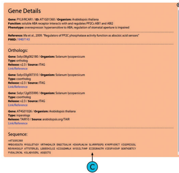
Figure 2. Screenshot of the DroughtDB web interface. (A) When hovering above a node in the Pathway Browser corresponding genes are highlighted in the Gene Table. (B) Hovering above a gene highlights all related nodes. (C) When selecting a gene from the table further details are shown.