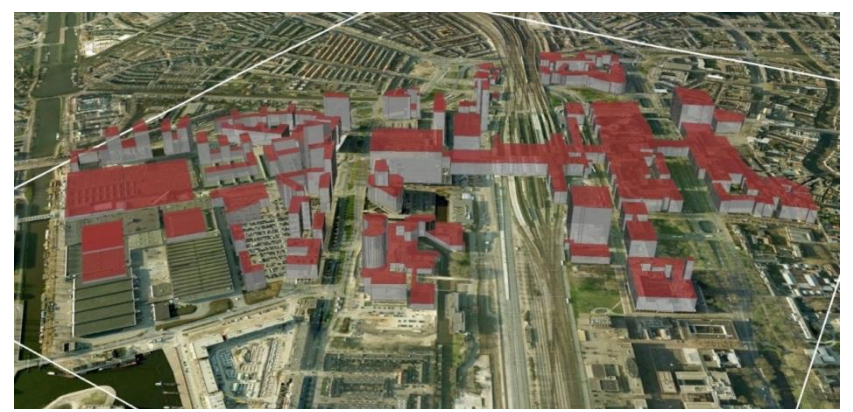
Figure 2: 3D model with level of detail 2 (LOD2) created in CityGML for 2030. The planned changes are reflected in the model. Most of the changes will take place in the Jaarbeurs area (Left corner). Planned modifications can be identified from Figure 1 and Figure 2.

The categorization used for both the model is as follows