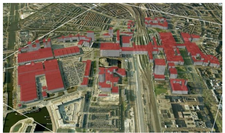
Figure 1: 3D model with level of detail 2 (LOD2) created in CityGML for 2015. This forms the basis for further solar potential analysis.