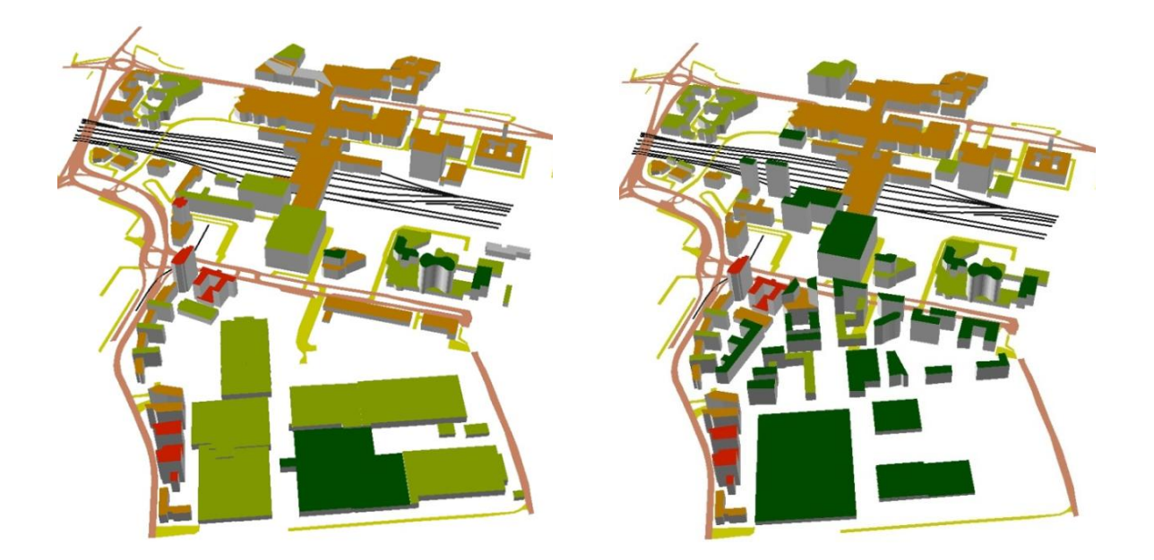
Figure 4: Roof top PV potential for the area in 2015 (left) and 2030 (right). Green roof tops are highly suitable for PV, Red are unsuitable and orange are partially suitable. For 2015 the rooftop potential was calculated at 16MWp and for 2030 the potential was estimated at 14.6 MWp due to the planned changes.

The planned developments for Utrecht city centre do not seem to affect the solar PV potential to a large extent. It is not possible to cover the whole electricity demand of the area with only PV power. The model underestimates the results about 5-10% as some of the assumptions bring down the potential. In order to make the region energy neutral other options like wind energy, and offsite solar parks or Bio-CHP's are to be considered.