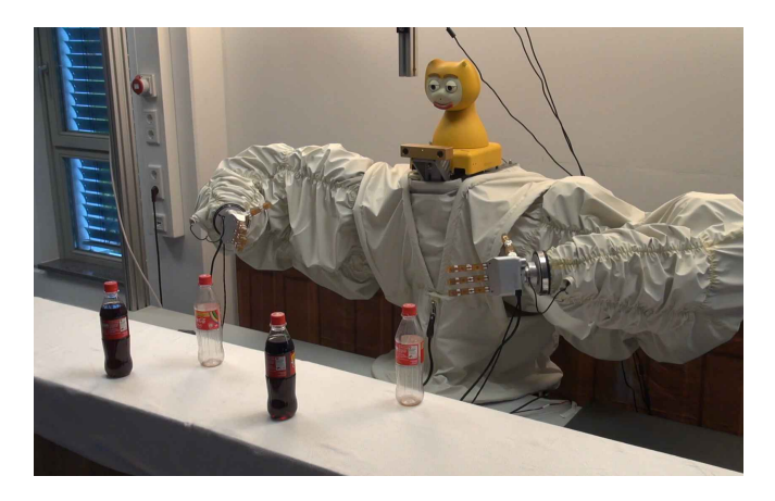
Fig. 3. In the VISUAL SENSING scenario, a camera is used to recognize empty bottles, which a bimanual robot is supposed to remove from the table to a "dishwasher" location on the left side, behind the table [1].