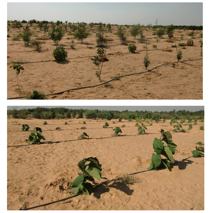
Figure 2:10-weeks old forest plantations (left: different species, right: Teak) in Sarabium forest near Ismailia.

Hörl (2012) showed that the potential of forest trees growing in Egypt is high: 134 Forestry-relevant tree-species that are growing in only two parks in Cairo were found. El Kateb and Mosandl (2012)