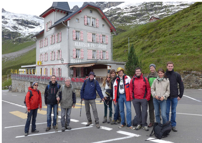
Figure 3: RiskLab excursion 2014 on the Klausenpass (Switzerland).