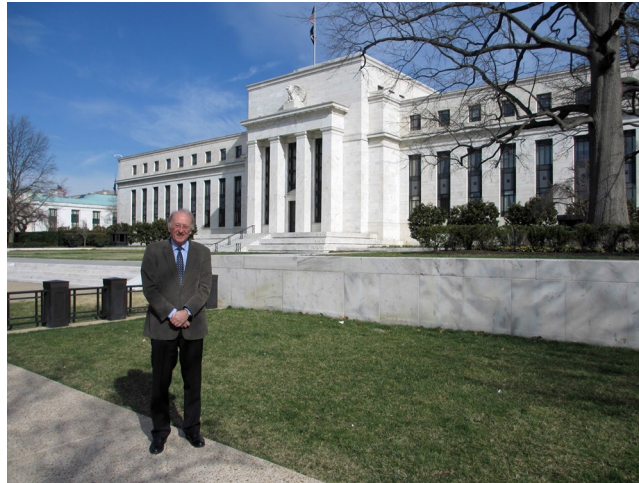
Figure 2: Paul Embrechts in 2014 in front of the FED building in Washington.