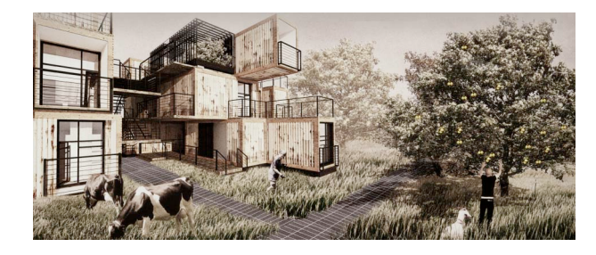
Figure 3: view of habitable containers solution (Students: A. Lisowska, P. Kuszneruk, M. Kaplan_ Technical University of Bialystok, Poland)

Two ex-aequo second best entries have been awarded. In the one submitted by the shortlisted team from TU Bialystok (Poland) [figure 3], the disruptive strength of a utopian urban vision brings to the evidence the contradictions of the contemporary model; it proposes a serious reflection on the neighbourhood conditions, focusing on the need of models of low cost dwellings used by newcomers moving in Turin and looking for job opportunities or students and young families starting their independent life experience, entailing possible directions for the definition of a new way to live.