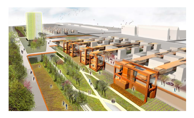
Figure 2: main view of the new neighborhood (Students: E. Pintabona, I. Sapienza, G. Motta_ Università La Sapienza di Roma, Italy)

The design features and elements perfectly support the idea of integration of built and natural environment.