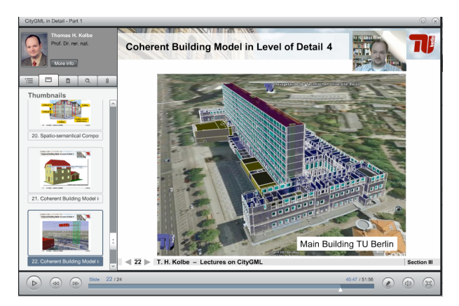
Figure 2: Desktop lecture on demand on CityGML http://www.igg.tu-berlin.de/courses

teacher giving his speech, along with synchronized images of his presentation slides and all the animations, annotations, and comments. Slides can be identified using thumbnails or keywords, allowing individual repetitions during the follow-up work. Exercises complete the training workflow. Additional information is documented in König & Kolbe, 2008.