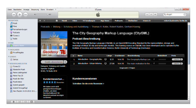
Figure 5: CityGML podcast in iTunes, and on iPod Touch

Moreover, we published the podcasts on two well-established platforms. The first and most common one is Apples iTunes Store, which requires the iTunes Client digital media player application. To be able to submit RSS feeds to the iTunes Store, you need to set up an account first. The RSS feed is checked and registered by iTunes and will be available in about 24 hours after transmission. Users are now able to query and subscribe our CityGML podcasts. In figure 5 you see a screen shot representing the appearance of the CityGML RSS feed within the iTunes Store, and on iPod.