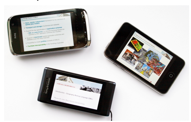
Figure 7: CityGML podcast on HTC Touch, Sony Ericson AINO, and iPod Touch

figure 7 the representation of the CityGML training course successfully works on different test devices.