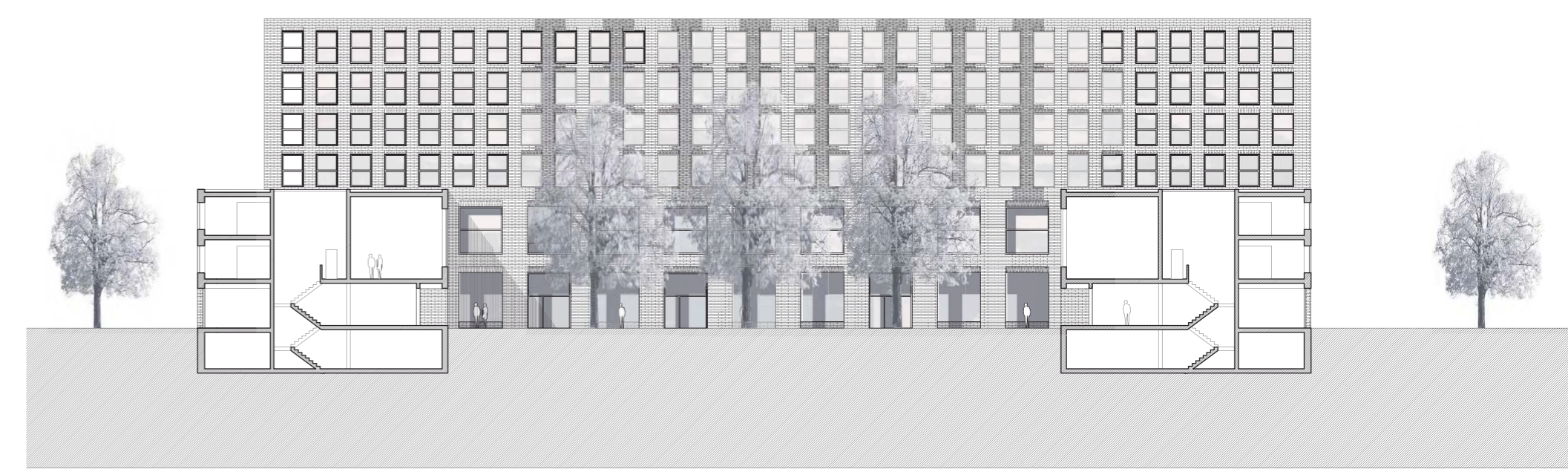
QUERSCHNITT M 1_200