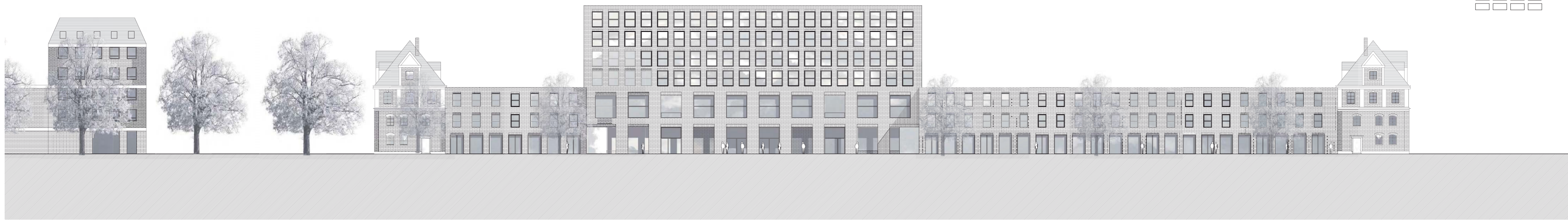
ANSICHT NORD-WEST M 1_200