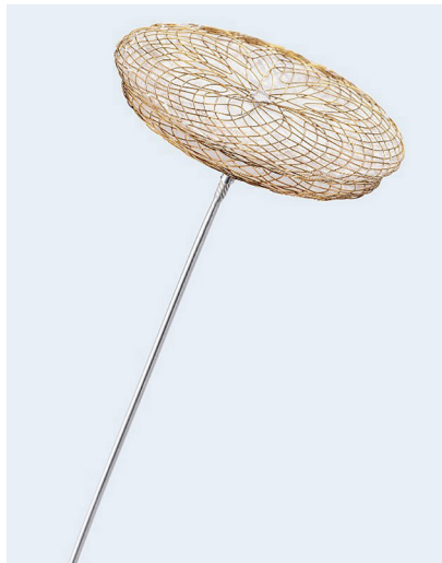
Figure 1 LifeTech CeraFlex™ ASD occluder. ASD, atrial septal defect.

Interventional procedures were conducted according to instructions for use and the standard approach of the respective study site. Transcatheter treatment was performed using standard intraprocedural imaging techniques such as TEE with