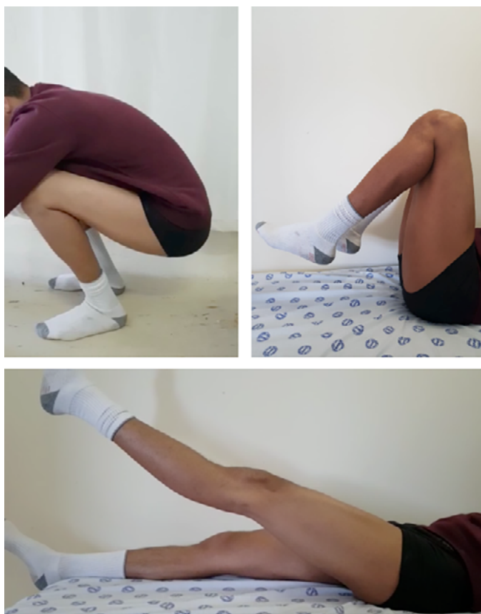
Figure 5. Clinical pictures of knee range of motion at one year postoperatively

was used to overdrill the osteochondral defect into a round shape and to a depth of 10 mm ( Figure 4 ). A marker pen was used to draw a circle with a 25 mm diameter onto the graft. A Kirschner wire drilled through the graft from side to side and bent on both ends was used to handle the slippery graft without a specialised workstation. A rongeur was used to shape the autograft for press-fit grafting ( Figure 4 ). No additional hardware was necessary. After infiltration with local anaesthetic, the wound was closed with multiple layers of absorbable sutures. The surgical time for the procedure was 1 hour 37 minutes.