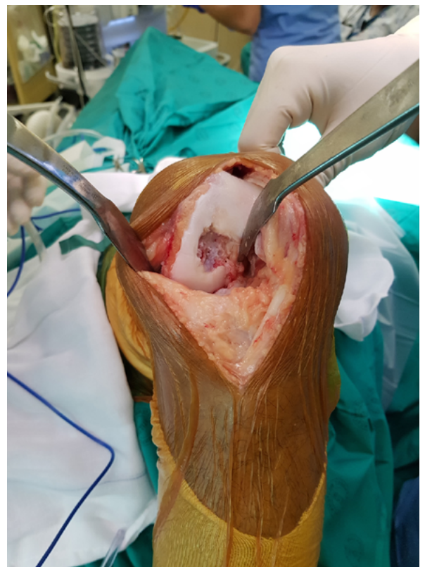
Figure 3. Intraoperative view of the defect in the distal medial femoral condyle