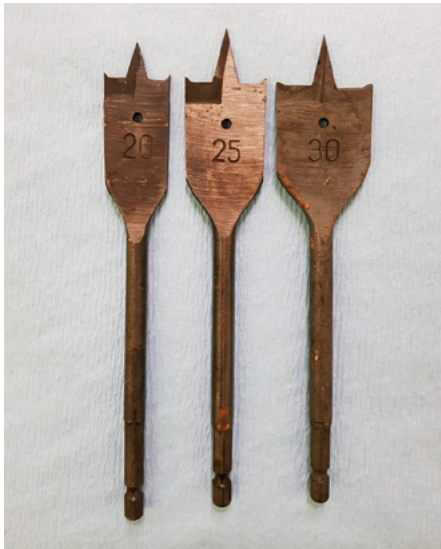
Figure 6. The flat drill bits obtained from a hardware store

less than 2 cm 2 , microfracture and OATS are recommended. With microfracture, treatment failure can be expected after five years postoperatively, whereas OATS has shown better intermediate and long-term outcomes. 10,11 In intermediate size lesions between 2 and 4 cm 2 OATS, microfracture and ACI (autologous chondrocyte implantation) is commonly performed, and in large lesions > 4 cm 2 treatment options are ACI and OCA (osteochondral allograft). 1,3,12