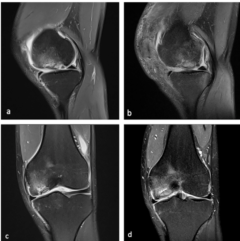
Figure 2. MRI images of the knee: a) sagittal views preoperatively and b) at six weeks postoperatively; c) coronal views of the knee preoperatively, and d) at six weeks postoperatively