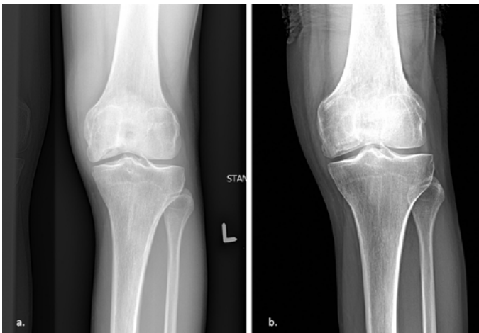
Figure 1. Anterior-posterior radiographs of the knee before surgery and at one year postoperatively

Hohman retractors were used to protect the medial collateral ligament and posterior cruciate ligament. The most dorsal cortex was carefully separated to avoid vascular damage. The osteochondral lesion measured 20 × 30 mm in size, and a 25 mm flat stainless steel drill bit obtained from the local hardware shop