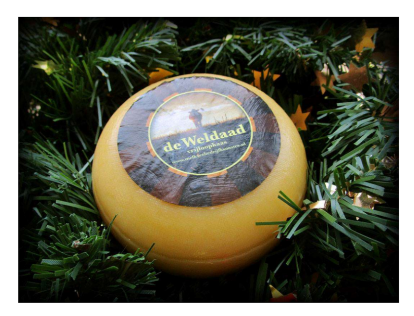
Figure 5. Freewalk cheese from cows on composting bedding material (farm Koonstra, Vinkenbuurt, The Netherlands).

The third participant was farmer from Koonstra in the Netherlands, who completed in May 2015 the construction of a CBP barn that combines different activities utilizing the composting bedded-pack material. His barn was constructed including pipes circulating water below the bedded-pack barn for picking up the heath that develops from the bedded-pack. The heath (i.e., energy is transported and used for warming up the visitors' room) and the water are partly delivered in the drinkers for the cattle in the barn, especially during winter time. Moreover, the farm Koonstra sells their own homemade cheese, called "freewalk compost cheese" (vrijloopkaas; see Figure 5). During Christmas time they sell Christmas trees and use the leftovers as bedding material in the barn. Farm Koonstra entertains a lot of visitors telling their story. The farmer stated that a leading principle is to "put the carbon from the wood chips in the soil instead of in the air". Additionally, he stated that "compost bedded-pack barns are a good story for marketing, based on happy cows and fertile soils". This farm is driven by innovation, communication and creating a circular economy.