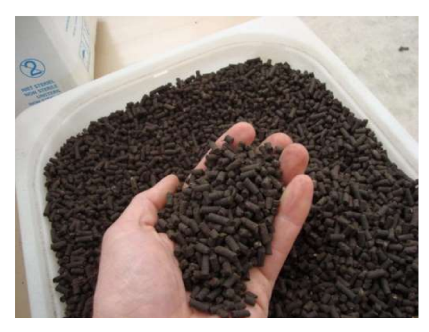
Figure 6. Pellets produced from composting bedded-pack material.