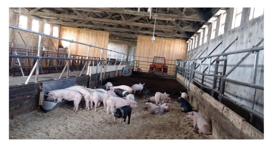
Figure 3. Utilizing composting bedded-pack barn for fattening of pigs during grazing season (Experimental farm Logatec, Slovenia).