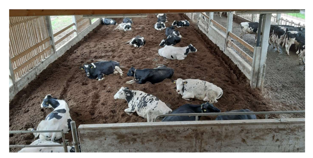
Figure 1. Compost bedded-pack barn for dairy cows (CBP).

One of the advanced sustainable uses of compost is from the compost bedded-pack barns (CBP), generally known as compost barns or freewalk barns (Figure 1). CBP was initially developed in Israel and the USA and spread with some modification to Europe in the last decade. The system allows cows more freedom to move than conventional tie-stalls and cubicle barns (free stalls), since it provides, when properly managed, a dry, comfortable, and healthy surface on which cows lie, stand, and walk [25,26]. CBP is composed of a large bedded-pack resting area that is aerated at least once a day, separated from a feed alley by a 1.2-m high concrete wall [27] (see Figure 1). CBP is applied with a completely free walking and lying area as an innovative housing system. The composting process in the barn requires the input of oxygen into the bedded-pack. This is achieved by cultivating the bedded-pack one to three times daily (see Figure 2). Additional stimulation of the composting process is done, especially in the Netherlands, by mechanically aerating the bedded-pack. Pipes are installed in the floor below the lying area, which aerate the bedded-pack by either sucking or pushing the air through the bedded-pack. The temperature of the composing bedded-pack at 20 cm deep is typically between 20 to 50 degrees Celsius.