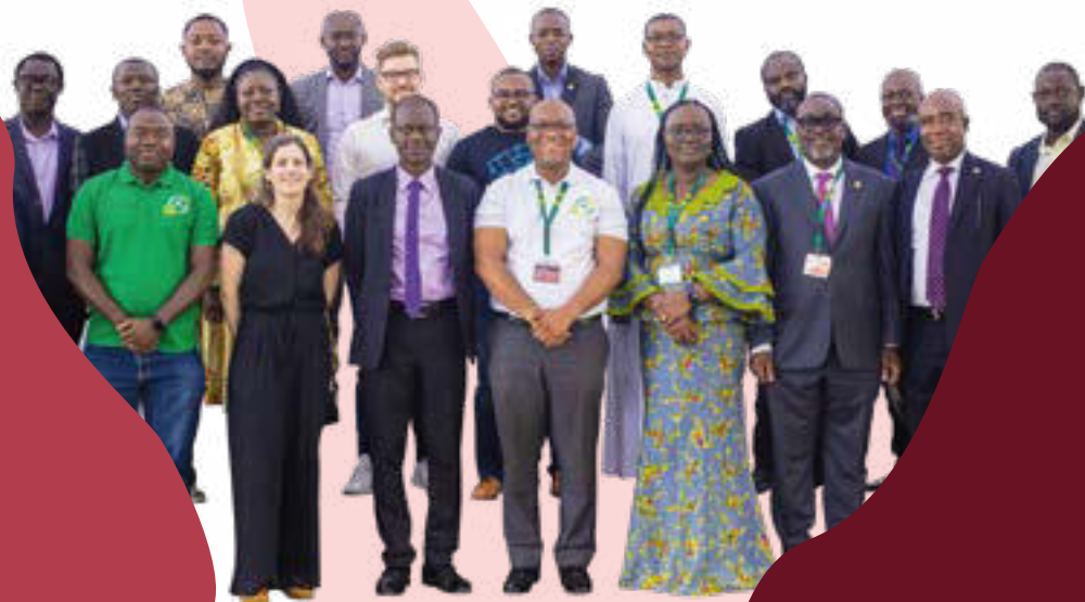
Members of TUM IEAI participate in a conference on “Responsible AI and Ethics – A Panacea to Digital Transformation in Sub-Saharan Africa” at KNUST, Ghana. RAIN-Africa co-hosted this event with the KNUST Responsible AI Lab.