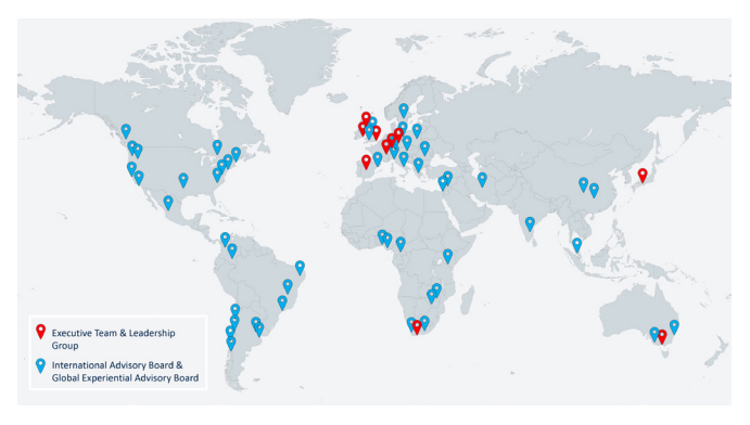
Figure 2 Global Alliance for Living Evidence on Anxiety, Depression and Psychosis: a global resource curated by a global community.

Our vision is a global resource curated by and relevant to a global community. The GALENOS team brings diverse perspectives from different geographical regions and an extensive network of collaborators from 35 countries (figure 2). It includes researchers across various aspects of mental health science (from biological to social sciences), affected communities and practitioners. Our responsibility is to generate a positive, equal and thriving environment for knowledge translation through rapid and effective use of our extensive partnerships and networks straddling high-income, middle-income and low-income contexts. We aim to build authentic, long-term engagement across all aspects of the project, creating optimal conditions for effective dissemination. We will train a global crowd of researchers who will join our collaborative volunteer effort to identify the most relevant