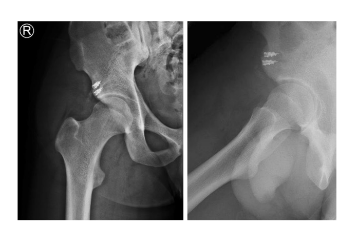
Fig. 3 Postoperative radiographs. The antero-posterior and false-profile X-rays of the right hip show correct anchor placement at the anterior inferior iliac spine (straight head was reduced to superior anchor) and the superior acetabular ridge (reflected head was reduced to inferior anchor) with two double-loaded 5.5-mm titanium suture anchors (Corkscrew®, Arthrex, Naples, USA)