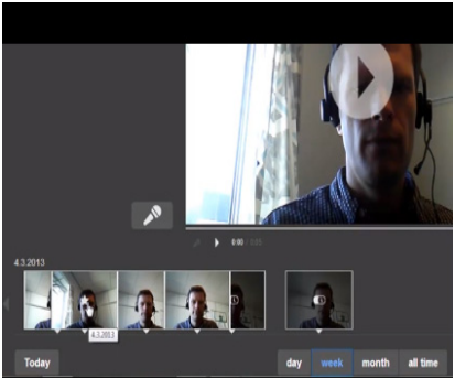
Fig. 1. Extract from TeamUp manual