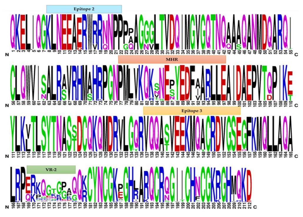
Figure 3. Graphical representation of the relative amino acid frequency of the partial SRLV gag-pol protein obtained by WebLogo 3 software. The height of the letter corresponding to each amino acid indicates its relative frequency at that specific position. Different colors indicate the physiochemical characteristics of the amino acid (black: non-polar, green: polar, red: aromatic, blue: positively charged, purple: negatively charged).

Furthermore, the relative frequency of the amino acid substitutions can be deduced from the height of the single letter corresponding to the specific amino acid (Figure 3).