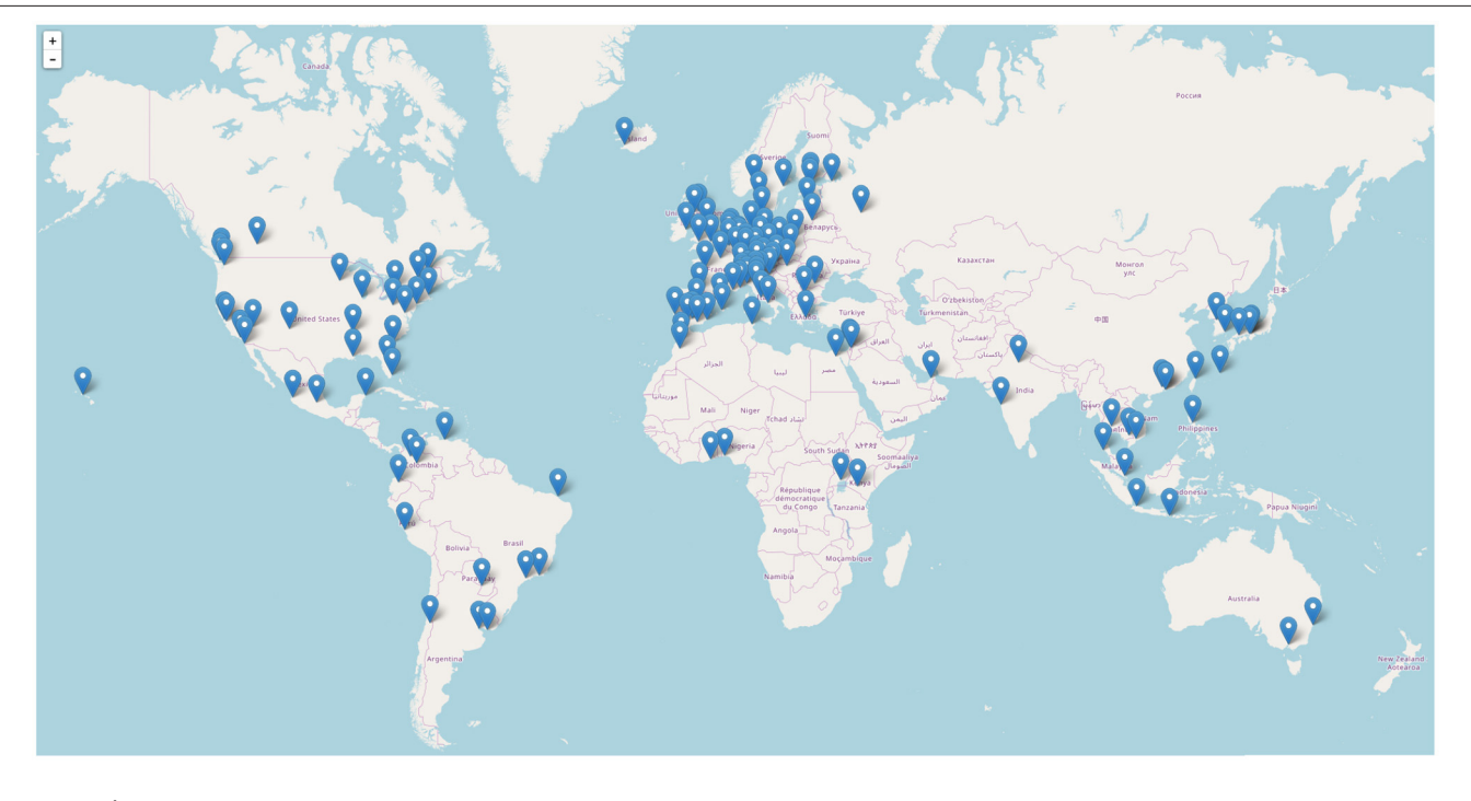
FIGURE 1 | Geographic distribution of the characterized cities. Map data @ OpenStreetMap contributors, see https://www.openstreetmap.org/copyright.