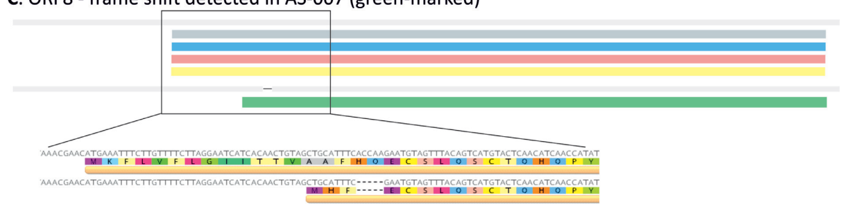
Fig. 1. Overview of sampling, diagnostic methods used and results. (A) Cases subjected to autopsy; RT-qPCR was performed with several samples of 13 COVID-19 deceased (results see Supplementary Table 2). SARS-CoV-2 whole-genome sequencing was performed for different samples of five marked cases. Respiratory tract was taken from pixabay (https://pixabay.com/). (B) Documentation of nucleotide exchanges in SARS-CoV-2 genomes found in five different individuals. Numbers above represent the nucleotide position of the exchange according to the reference SARS-CoV-2 isolate 2019_nCoV Muc IMB1 (first German case; accession number LR824570). Exchanges are marked in the color of the case. The nucleotide in position 23415 represents the S-614 type (nucleotide G stands for S-614G; nucleotide A stands for S-614D). (C) The 5-nucleotide deletion in position 26955 results in a frame shift in ORF8 (lower green-marked ORF8) in contrast to the ORF8 of the other cases with typical length. Light grey lines symbolize nucleotide sequences. The extended insert shows the nucleotide deletion with translation into amino acids downstream the beginning of ORF8

The sequences show the closest relationship to sequences reported from Jamaica and France (Supplementary Figure 1), and go back to an original virus variant exhibiting an S-614D type that was circulating early in the pandemic until it was replaced by the more infectious