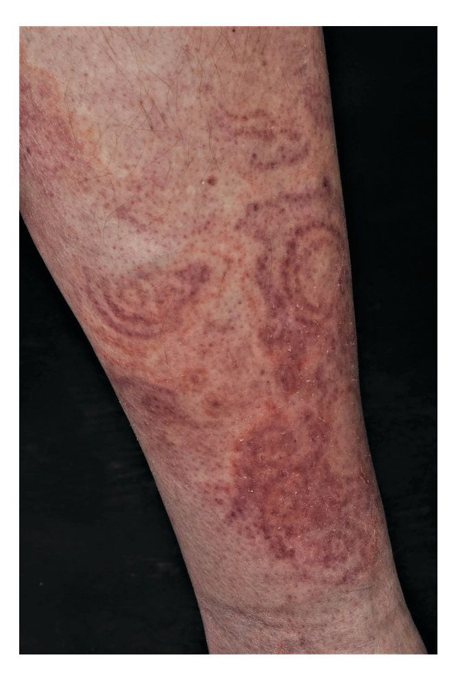
Figure 2 Clinical picture of erythema gyratum repens (57 y/m).

Since its first description, EGR has been linked to a variety of different malignancies, most frequently including bronchial (32 %), esophageal (8 %) and breast (6 %) cancer [23]. Similar to the first published case of Gammel, skin lesions typically precede the occurrence of neoplasia by four to nine months. In the past, EGR has therefore been considered to be an obligatory paraneoplastic cutaneous skin disease, although an underlying neoplasm could only be detected in