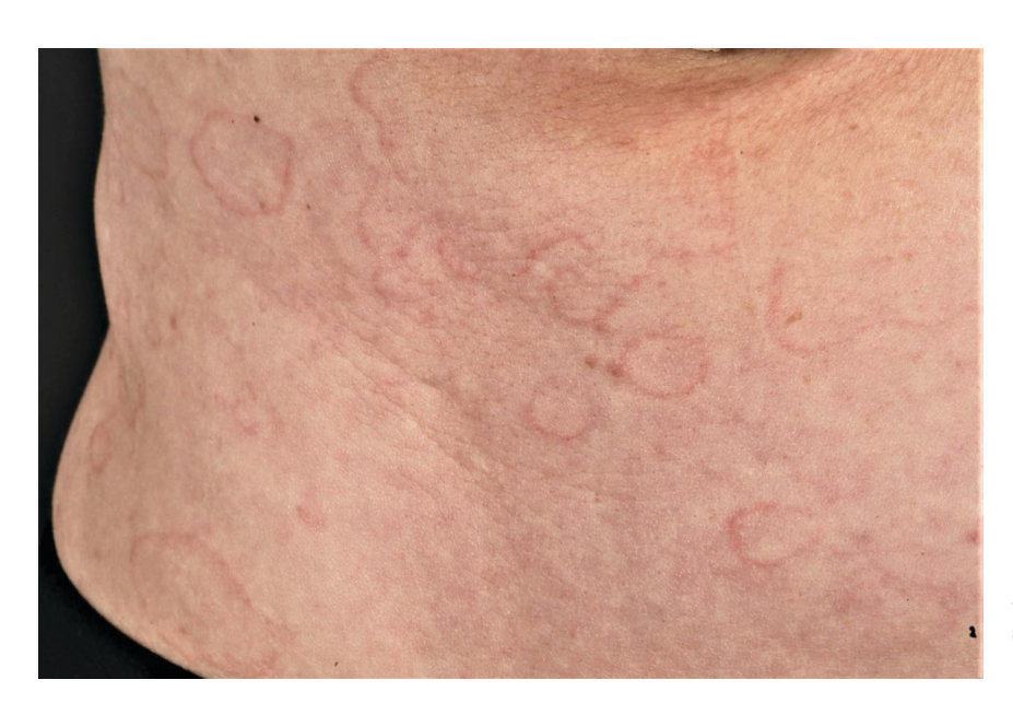
Figure 1 Clinical picture of erythema annulare centrifugum, (50 y/f, archives of Dept. of Dermatology and Allergology, Biederstein, TUM).

EAC as the clinical and histological collision of the superficial and deep gyrate erythema, which is named mixed type [10, 11].