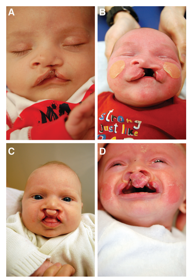
Fig. 1. Classification according to the severity of cleft lip and palate. Representative photographs (camera body: Nikon D40; Japan; lens: Nikkor AF-S micro 600 mm 1:2.8 G ED; Nikon, Japan) of cases with moderate (A and C) and severe (B and D) subclassified unilateral (A and B) and bilateral (C and D) cleft lip palate.

aesthetically according to nasal form, nasal symmetry, and cupid's bow. The counts were collected and summarized for all raters for each match.