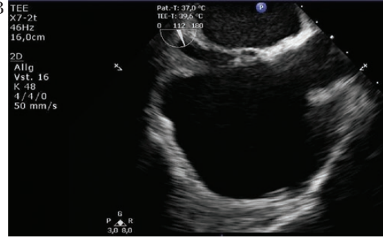
Figure 1. Transesophageal echocardiography (TEE) results. A, TEE revealing mobile vegetation from the right atrium to the superior vena cava. B, Control TEE with elimination of endocarditis vegetation.