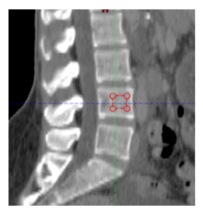
Fig. 1 Region of interest (ROI) placement for the measurement of CT density (in HU) in the planning CT. In the sagittal plane of the planning CT, a square ROI ( red ) half the height of the lumbar vertebra was placed in the ventral half of the trabecular compartment of the fourth lumbar body by tilting the CT image in order for the trabecular compartment to be parallel to the sides of the square ROI and was subsequently used to show mean attenuation values of the trabecular bone (in HU)

ning computed tomography scan (CT) and re-contoured the PIF region on the planning CT with MRI guidance using the ARIA oncology information system (Varian Medical Systems, Palo Alto, CA, USA). Then, on the contralateral side of the fracture, a mirrored structure of the fracture (mPIF) was generated. We also manually contoured the sacrum for all patients.