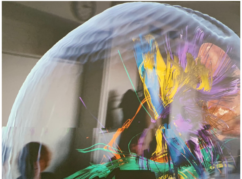
Fig. 3 The figure shows another screenshot visualizing the participants view during the application of AR for fiber dissection. The different colors show different tracts. The tractography model is projected in the room

purposes (Table 2). Moreover, proven by the composition of the participants, various disciplines frequently use this technique for the visualization of white matter pathways, and 92.3% of participants evaluated the presented cases as reflecting their clinical reality. Hence, the present results of the evaluation of AR for fiber dissection as a new