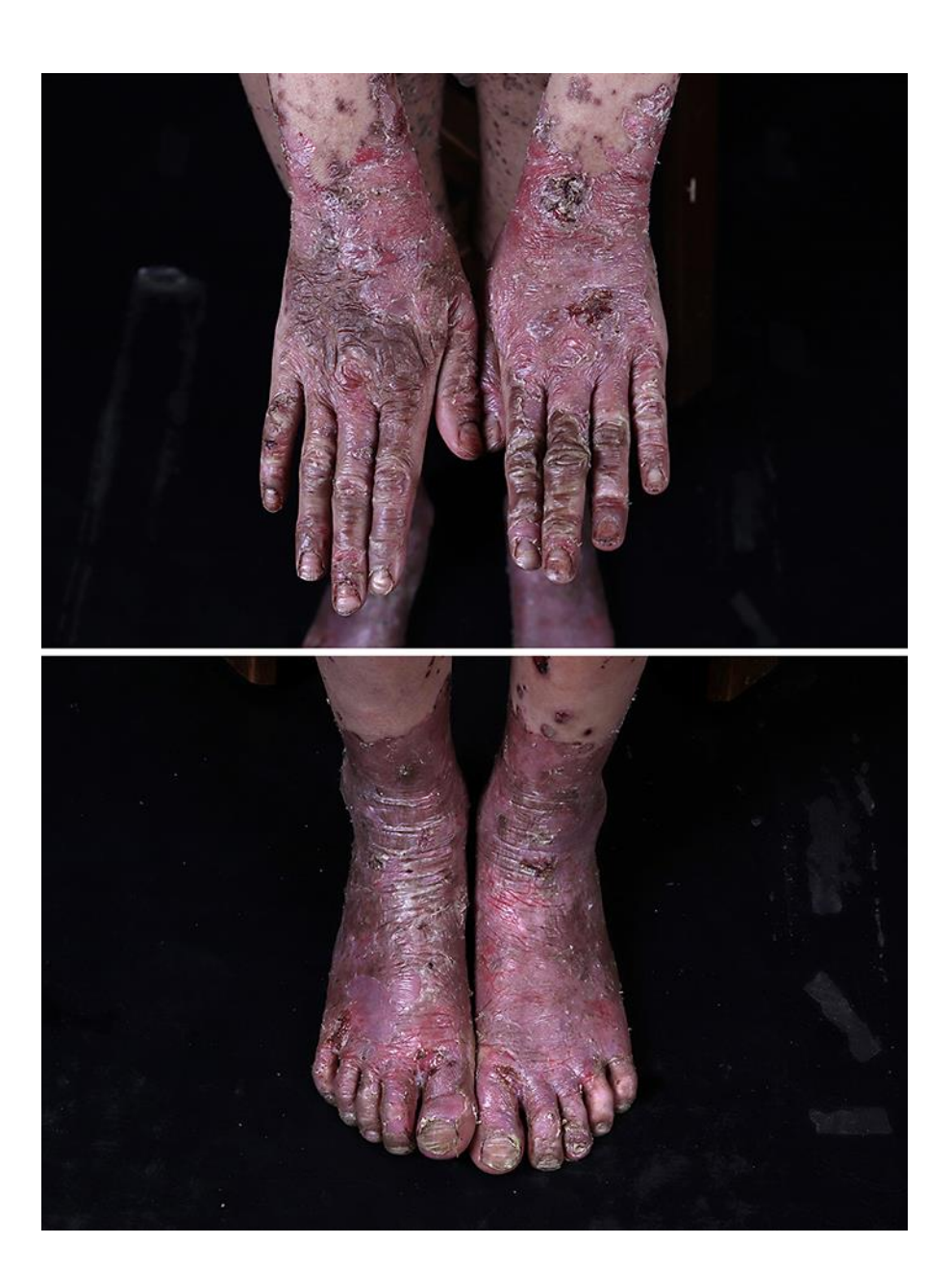
Fig. 3. Opaque change of all finger and toe nails with multiple Beau lines and perionychia.

\ \ \, \ \ \, \ \ \, \ \, \ \, \ \ \, \ \ \, \ \ \, \ \ \, \ \ \, \ \ \, \ \ \, \ \ \, \ \ \, \ \ \, \ \ \, \ \ \, \ \ \ \ \ \ \ \ \ \ \ \ \ \ \ \ \ \ \ \ \ \ \ \ \ \ \ \ \ \ \ \ \ \ \ \ \ \ \ \ \ \ \ \ \ \ \ \ \ \ \ \ \ \ \ \ \ \ \ \ \ \ \ \ \ \ \ \ \ \ \ \ \ \ \ \ \ \ \ \ \ \ \ \ \ \ \ \ \ \ \ \ \ \ \ \ \ \ \ \ \ \ \ \ \ \ \ \ \ \ \ \ \ \ \ \ \ \ \ \ \ \ \ \ \ \ \ \ \ \ \ \ \ \ \ \ \ \ \ \ \ \ \ \ \ \ \ \ \ \ \ \ \ \ \ \ \ \ \ \ \ \ \ \ \ \ \ \ \ \ \ \ \ \ \ \ \ \ \ \ \ \ \ \ \ \ \ \ \ \ \ \ \ \ \ \ \ \ \ \ \ \ \ \ \ \ \ \ \ \ \ \ \ \ \ \ \ \ \ \ \ \ \ \ \ \ \ \ \ \ \ \ \ \ \ \ \ \ \ \ \ \ \ \ \ \ \ \ \ \ \ \ \ \ \ \ \ \ \ \ \ \ \ \ \ \ \ \ \ \ \ \ \ \ \ \ \ \ \ \ \ \ \ \ \ \ \ \ \ \ \ \ \ \ \ \ \ \ \ \ \ \ \ \ \ \ \ \ \ \ \ \ \ \ \ \ \ \ \ \ \ \ \ \ \ \ \ \ \ \ \ \ \ \ \ \ \ \ \ \ \ \ \ \ \ \ \ \ \ \ \ \ \ \ \ \ \ \ \ \ \ \ \ \ \ \ \ \ \ \ \ \ \ \ \ \ \ \ \ \ \ \ \ \ \ \ \ \ \ \ \ \