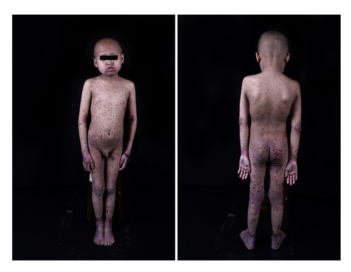
Fig. 2. Erythematous vesicles with erosion and some covered with hemorrhagic crusts in almost the entire body. Acute and chronic eczematous changes can be observed mainly in the flexural aspects of the extremities, typical of AD.

\ \ \, \ \ \, \ \ \, \ \, \ \, \ \ \, \ \ \, \ \ \, \ \ \, \ \ \, \ \ \, \ \ \, \ \ \, \ \ \, \ \ \, \ \ \, \ \ \, \ \ \, \ \ \, \ \ \, \ \ \ \ \, \ \ \ \ \ \ \ \ \ \ \ \ \ \ \ \ \ \ \ \ \ \ \ \ \ \ \ \ \ \ \ \ \ \ \ \ \ \ \ \ \ \ \ \ \ \ \ \ \ \ \ \ \ \ \ \ \ \ \ \ \ \ \ \ \ \ \ \ \ \ \ \ \ \ \ \ \ \ \ \ \ \ \ \ \ \ \ \ \ \ \ \ \ \ \ \ \ \ \ \ \ \ \ \ \ \ \ \ \ \ \ \ \ \ \ \ \ \ \ \ \ \ \ \ \ \ \ \ \ \ \ \ \ \ \ \ \ \ \ \ \ \ \ \ \ \ \ \ \ \ \ \ \ \ \ \ \ \ \ \ \ \ \ \ \ \ \ \ \ \ \ \ \ \ \ \ \ \ \ \ \ \ \ \ \ \ \ \ \ \ \ \ \ \ \ \ \ \ \ \ \ \ \ \ \ \ \ \ \ \ \ \ \ \ \ \ \ \ \ \ \ \ \ \ \ \ \ \ \ \ \ \ \ \ \ \ \ \ \ \ \ \ \ \ \ \ \ \ \ \ \ \ \ \ \ \ \ \ \ \ \ \ \ \ \ \ \ \ \ \ \ \ \ \ \ \ \ \ \ \ \ \ \ \ \ \ \ \ \ \ \ \ \ \ \ \ \ \ \ \ \ \ \ \ \ \ \ \ \ \ \ \ \ \ \ \ \ \ \ \ \ \ \ \ \ \ \ \ \ \ \ \ \ \ \ \ \ \ \ \ \ \ \ \ \ \ \ \ \ \ \ \ \ \ \ \ \ \ \ \ \ \ \ \ \