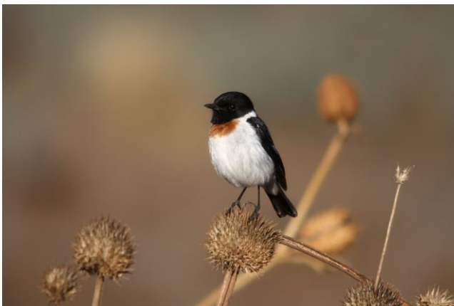
FIGURE 1 Adult male African stonechat

Here, we compare telomere length of two closely related sister taxa of stonechats, Saxicola torquatus axillaris (Figure 1) and Saxicola rubicola that breed in tropical and temperate environments, respectively (Doren et al., 2017; Urquhart, 2002). At all latitudes, stonechats are socially monogamous, open habitat, insectivorous passerines that aggressively defend breeding territories (Apfelbeck, Mortega, Flinks, Illera, & Helm, 2017). However, they vary in pace of life according to their environment (Ricklefs & Wikelski, 2002). Stonechats show a latitudinal cline in metabolic rate, with genetically inherited, higher metabolic rates in higher-latitude populations (Klaassen, 1995; Tieleman et al., 2009; Versteegh, Schwabl, Jaquier, & Tieleman, 2012; Wikelski, Spinney, Schelsky, Scheuerlein, & Gwinner, 2003). Further, temperate stonechats have a genetically fixed larger clutch size than tropical ones (Gwinner, König, & Haley, 1995), and their higher fecundity correlates with elevated baseline corticosterone concentrations during the breeding season (Apfelbeck, Helm, et al., 2017). In agreement with lower adult extrinsic mortality in tropical environments, local survival of tropical stonechats appears to be much higher than that of temperate