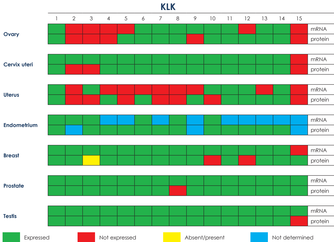
FIGURE 1. Comparative mRNA and protein expression in normal tissues of the reproductive tract

fifteen KLKs low to moderate protein levels were determined in tissue extracts of the uterus (KLK1, 4, 6, 9 and 11-14), seven were not (Figure 1). At the mRNA level, low to moderate values for six of the KLKs were detected (KLK1, 3, 10-12 and 14) (Figure 1).