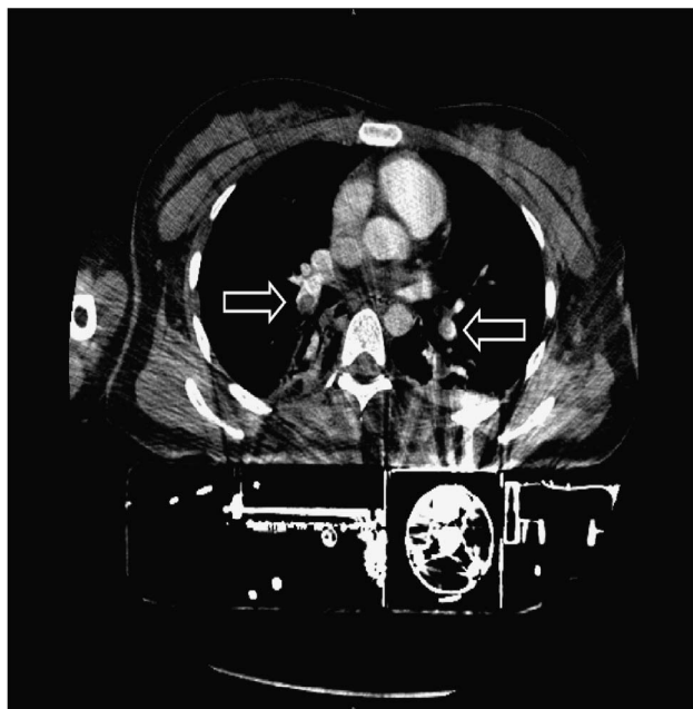
Figure 2. Contrast enhanced chest CT showing central pulmonary embolism of both sides (arrows).

device was put on hold shortly, whilst the whole body CT was performed. Contrast-enhanced CT of the chest showed a central pulmonary embolism of both sides (Figure 2).